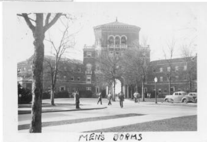
First a Women's then the Men's Dorms