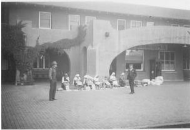
INDIANS AT CLOVIS, N.M.