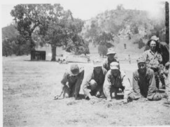
SCRUBBING THE GROUND