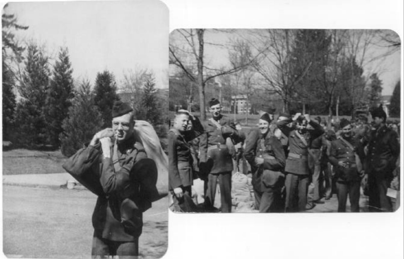
Preparing to march to Corvallis train station