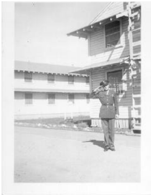
Now, A Real Soldier

decided to try and take things into my own hands. I wanted to be a SOLDIER and in the fight! While waiting my turn, I memorized the eye chart. At the end of my physical, the examining medical officer commented on the remarkable improvement in my eyesight. I explained my desire to fight for my country and not be in an outfit with a bunch of misfits. He obviously admired my spirit as I was promptly reclassified 1-A.