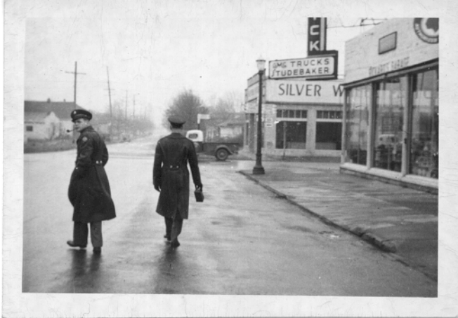
Off to Portland