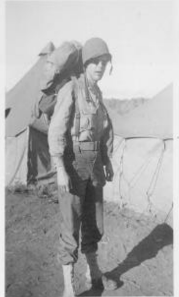
UP WE GO!