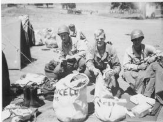
PACKING OUR BARRACK BAGS