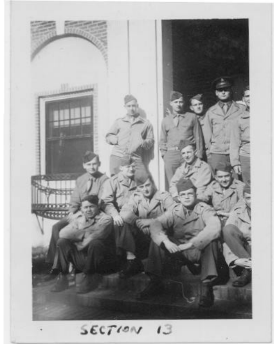
Some of my buddies

Despite the pressure, we all (or most of us) enjoyed it. We soon made friends with our new classmates and had lots in common. We were also practically the only, at least able-bodied, men on campus and our presence was obviously welcome to the young ladies. Mixer dances were held and dating and romances soon bloomed. Others brought their fiancé's from home, got married, and took a place just off campus and some of those already married were soon joined by their wives. During the week, however, all soldiers were required to sleep in the dorm. One young Oregonian lassie picked me out at a dance and, on a canoe ride way up a small stream in a forested but remote city park area, practically took my virginity from me. A few weeks later, she told me she was "late" but that pronouncement was premature. Nevertheless, it scared the hell out of me and I preserved my semi-celibacy until after the war was over in Europe. I did, however, meet some lovely girls both on campus and elsewhere in Oregon.