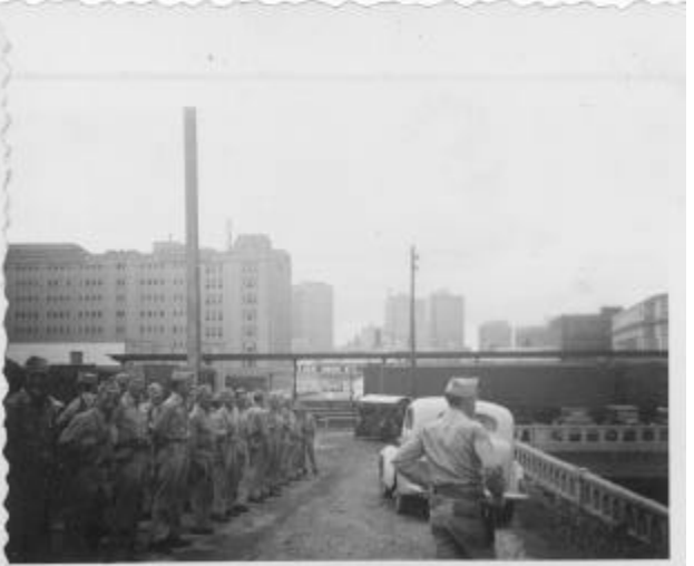
FORT WORTH, TEXAS

Butner was a huge, sprawling army base typical of the times with rows upon row of barracks, mess halls, and offices supplemented by a hospital, space for artillery and vehicles, movie houses, USO, recreation hall, chapels and what have you. It was relatively flat with plenty of space for maneuvers and firing exercises. It was located fairly close to Raleigh and Durham, which proved to be good "liberty" towns and we quickly learned to covet those lovely southern belles.