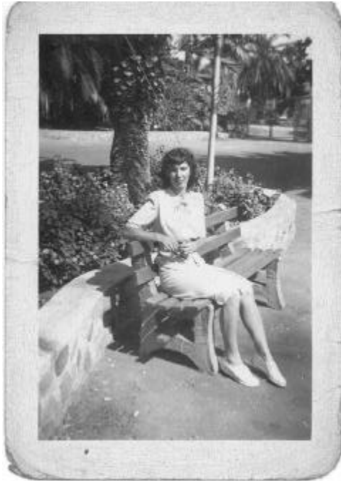
My Campus Sweetheart