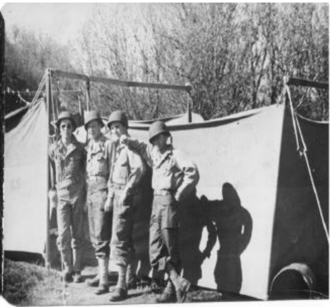
The Necessities of Life