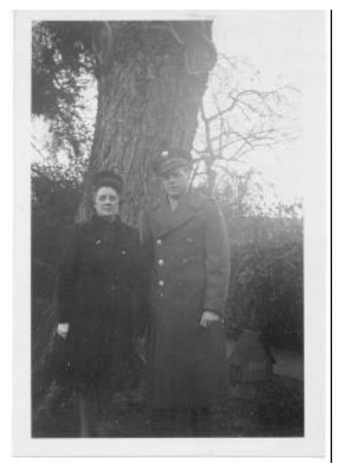
Mom and me

In the third term, things started getting tough for me. While I was doing OK in math, the course work was often based on a level of math I had not yet studied or mastered, e.g., in physics, and consequently it was affecting my grades in non-math but related courses. In retrospect, I did much better than the average in holding on through the third term but I knew the end was in sight for me. During