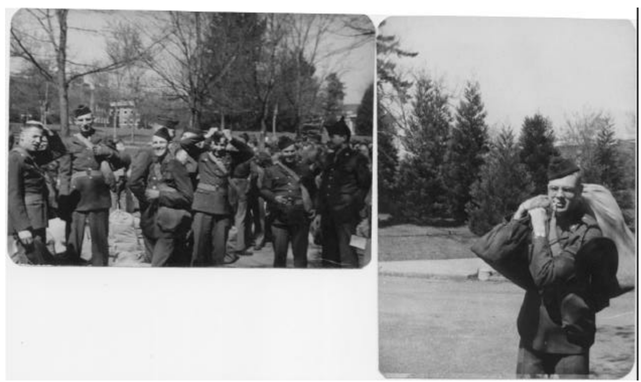
Preparing to march to Corvallis train station

The ending was worth a Hollywood movie. After many, prolonged goodbyes at dances, walks in the park, etc., the fatal day arrived We assembled outside our dorms with everything we owned in one duffle bag and marched down to the Railroad Station where the troop train was waiting for us and the OSC band was playing. OSC students, friends and faculty were there to give us a resounding sendoff. Wives and sweethearts were being separated for who knows how long, maybe forever, and the spirit grabbed the crowd. A girl that I had dated a few times but was no big thing to me, apparently didn't have anyone to kiss goodbye so, caught in the moment, she sought me out and overwhelmed me with hugs and kisses. That didn't help a thing. So, it was bye bye OSC and all the "beavers" left behind (but OSC would hear from me again)<sup>5</sup>.