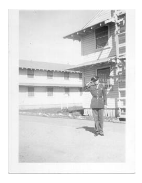
Now, A Real Soldier

improvement in my eyesight. I explained my desire to fight for my country and not be in an outfit with a bunch of misfits. He obviously admired my spirit as I was promptly reclassified 1-A.