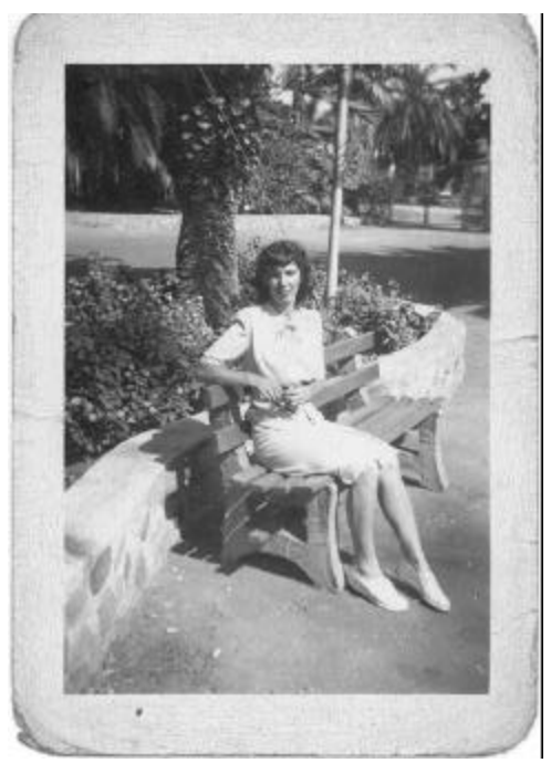
My Campus Sweetheart

and felt our feet freezing into ice blocks. Man, it was cold! However, we lucked out. There were four lovely and sweet girls our age from Salem also visiting for the weekend. We hooked up had had a great time